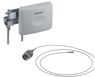
SNCA-AN1 Wireless LAN Antenna (Optional accessory for the SNCA-CFW1 Wireless card)