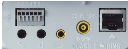
SNC-P5 Rear Panel

Camera settings, controls, and monitoring can be easily accomplished with a user-friendly graphical user interface (GUI) on the PC monitor.