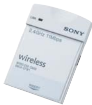
SNCA-CFW1 Wireless Card